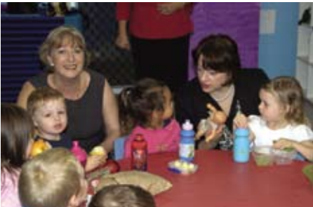
With Shadow Childcare Minister Sophie Mirabella at Creative Kids Child Care, Clontarf