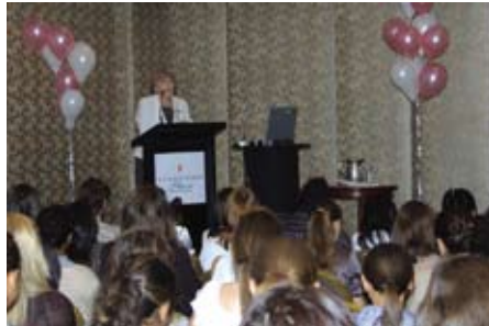
Addressing Year 11 students at Clayfield College Career Day